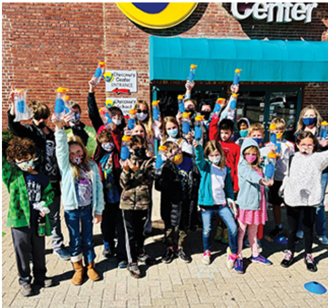
Discovery Center of Springfield (MO)—one of only two U.S. science centers not to shut down during Covid—was a museum that became a school for children in need. It also took top honors in the inaugural STOP Awards in 2021.

So with a world shut down by a pandemic, those who can, did. Charter networks turned on a dime to deploy powerful delivery systems to students at home so that they'd not lose the education they most deserved. Parents opened their homes to neighbors and created microschoools, hundreds of which still are going strong and expanding. Catholic school enrollment, declining for years, skyrocketed. Independent minded public school leaders in some pioneering states delivered education through community organizations. Museums became schools , tutoring programs became lifelines for families without access to an innovative education