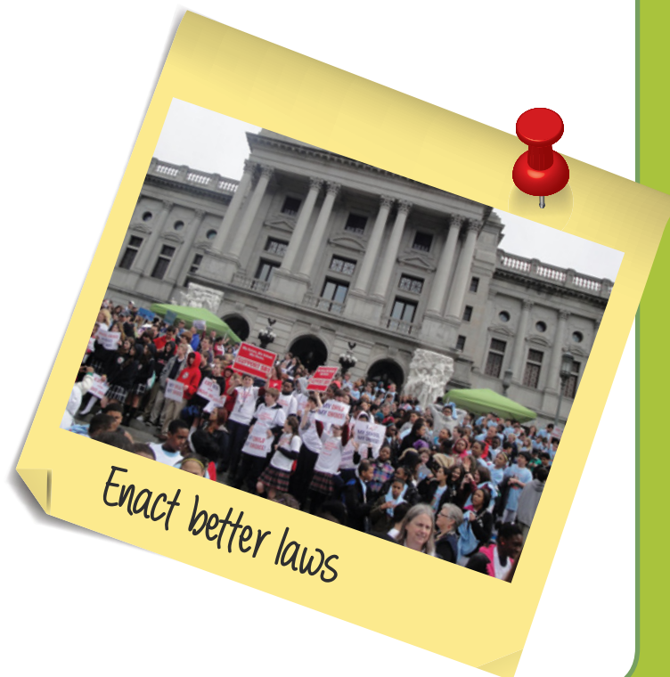
Enact better laws

Whether you are looking into how well your governor serves you, how well your local press covers the issues, or the quality of useful information your state provides to you about your schools, the Parent Power Index is a critical ingredient for making decisions affecting families and communities and for policymakers. It is a roadmap to economic and educational improvements across the states.