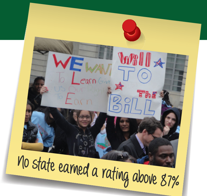
No state earned a rating above 87%

High Parent Power! scores stem from a strong charter school law, with multiple and independent charter authorizers and no cap on the number of charter schools that can be created. Choice programs such as scholarships and online learning are available to students to attend better schools no matter what their socio-economic status or zip code. Teacher effectiveness is regularly assessed and is based heavily on student achievement and growth. Information about schools and local elections is transparent and easy to access for parents. Typically, these states are more reliable in their media coverage of education-reform issues and have, or had at one point in time reform-minded executives leading their state.